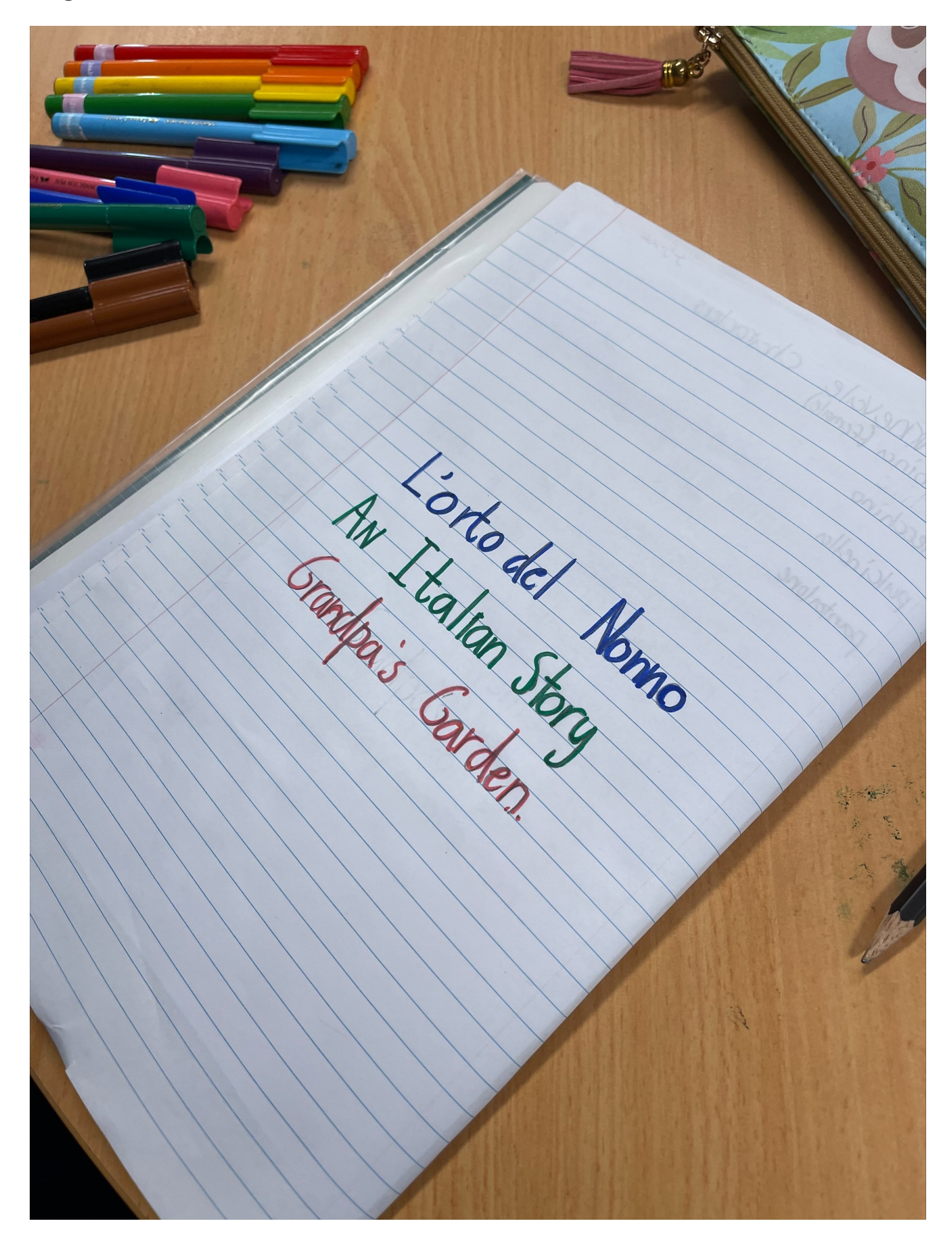
The Year 4/5 students have commenced their unit of work on L'Orto del Nonno. This term they will explore and learn vocabulary for vegetables, animals and insects and also focus a little on sustainable gardens.