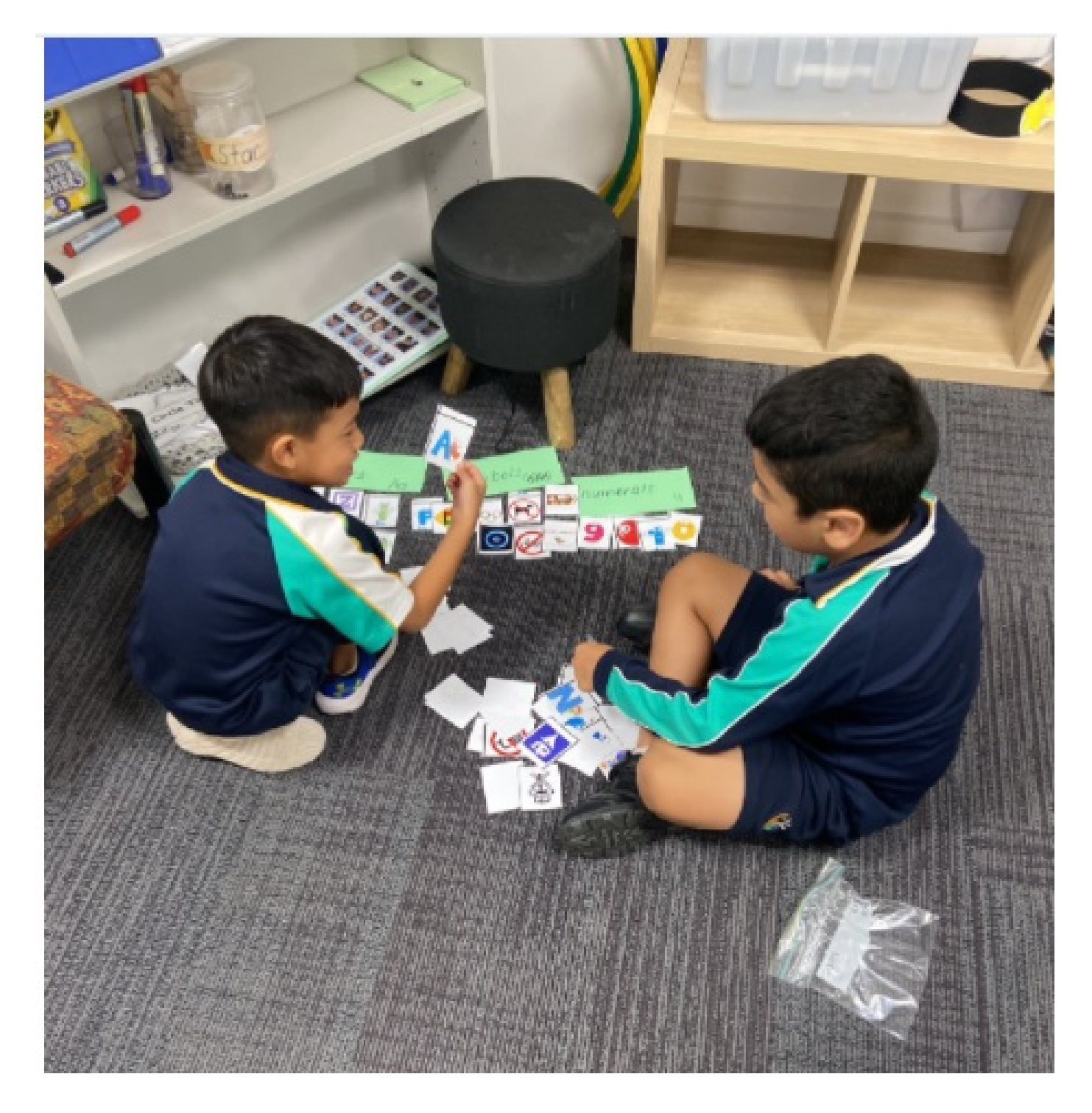
Term 1 has started!

The students are learning so much...learning all of the new procedures and routines of a classroom, building new friendships and enjoying our beautiful new space.